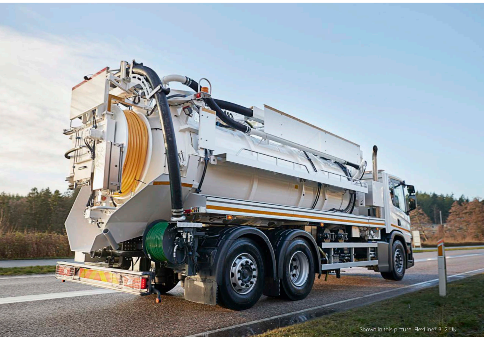
Shown in this picture: FlexLine® 312 UK

A multi-purpose unit for private household work, water companies and industrial clients.